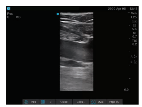
Figure 3. Long-axis view of the femoral vein, with spontaneous echogenicity and slow flow.

ever, other markers of disseminated intravascular coagulation remain relatively unchanged.<sup>7</sup> The prothrombin time and activated partial thromboplastin time are only mildly prolonged, if at all, and platelet counts are usually normal or only mildly low (100–150 × 10^9/L ).<sup>8-10</sup>