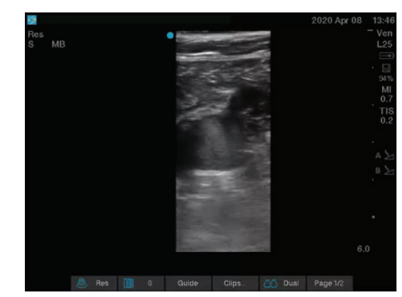
Figure 2. Another short-axis view of the femoral vein (center) and the femoral artery (bottom right) at the site of the saphenous vein inflow (top right). Swirling pattern of high echogenicity suggests low-flow state.